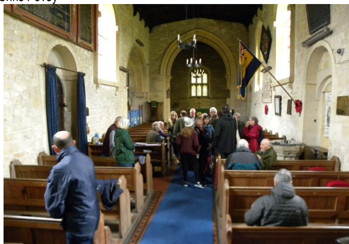
View down the Nave before the real crush started.