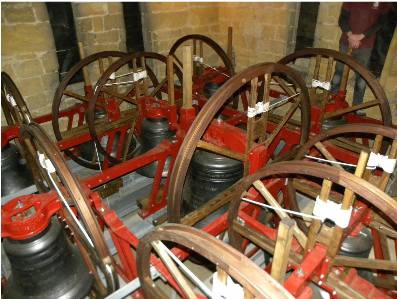
BLOCKLEY'S NEW BELLFRAME – FOR THOSE INTERESTED IN SUCH THINGS.... (Tenor in the middle, treble, 2 nd & 3 rd bottom right, 4 th & 5 th bottom left, 6 th & 7 th adjacent to tenor, 8 th & 9 th far right)